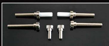
Flanges with different length For pre-assembling connector